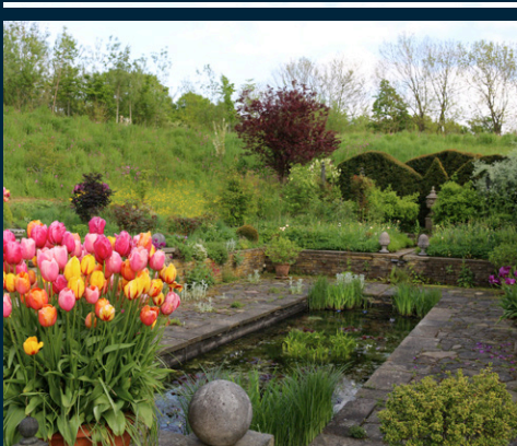
RHS Harlow Carr