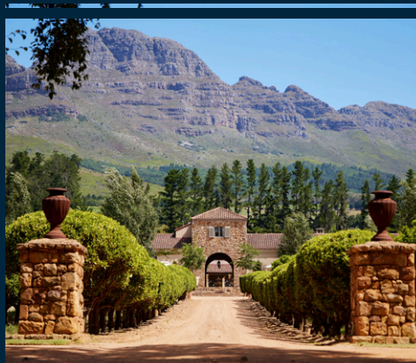
Winery in Stellenbosch