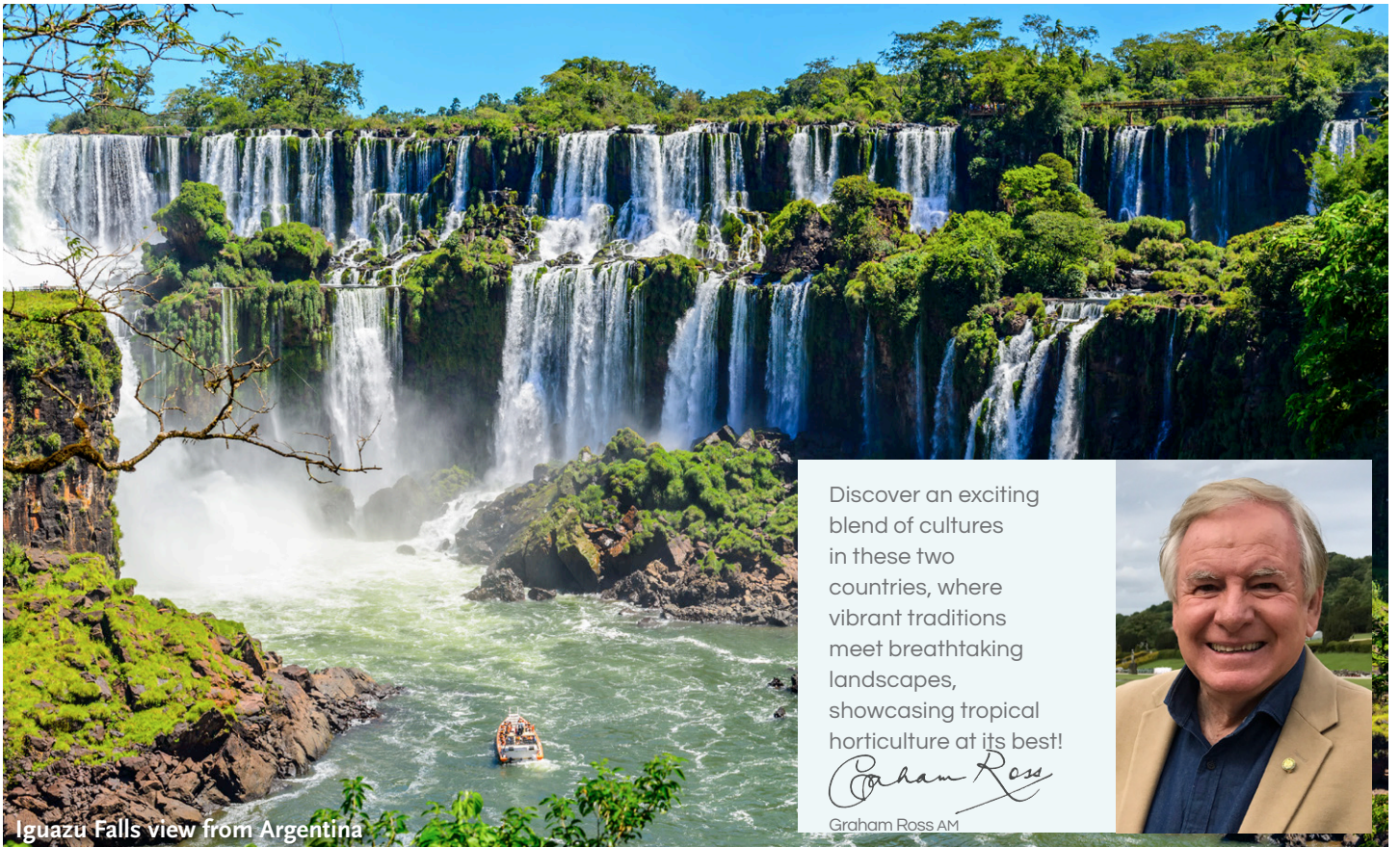
Iguazu Falls view from Argentina

Discover an exciting blend of cultures in these two countries, where vibrant traditions meet breathtaking landscapes, showcasing tropical horticulture at its best!