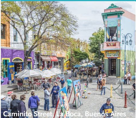
Caminito Street, La Boca, Buenos Aires