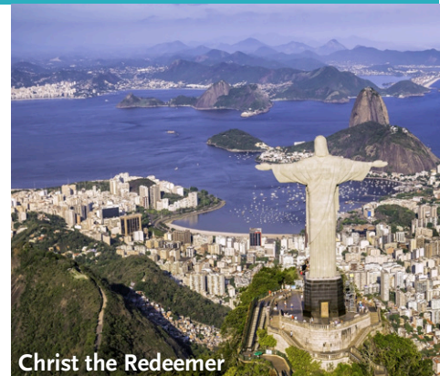
Christ the Redeemer