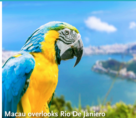
Macau overlooks Rio De Janeiro