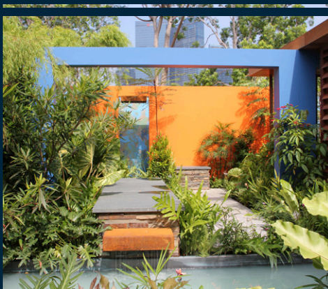
Singapore Garden Festival