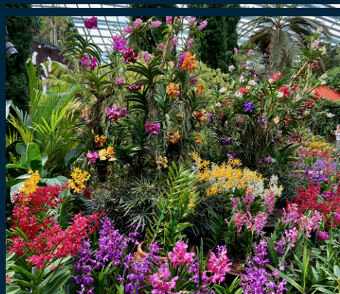
Flowers in the Cloud Forest