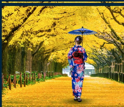
Traditional Japanese kimono