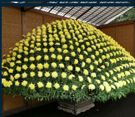
Shinjuku Gyoen Chrysanthemum Festival