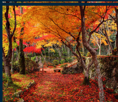
Abundant autumn colours