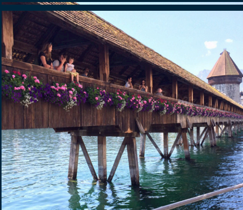
Chapel Bridge, Lucerne