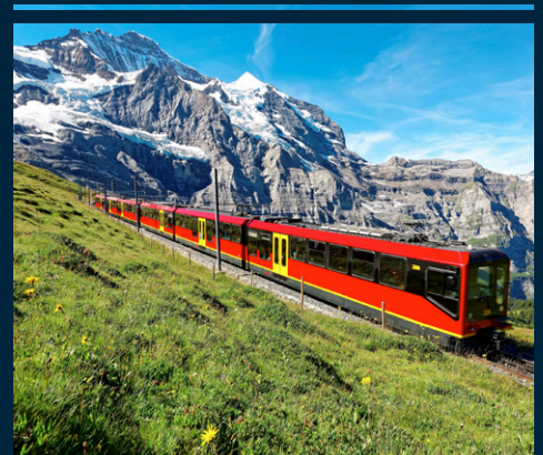
Jungfrauoch cog railway