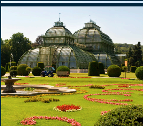
Palm House at Schonbrunn, Vienna